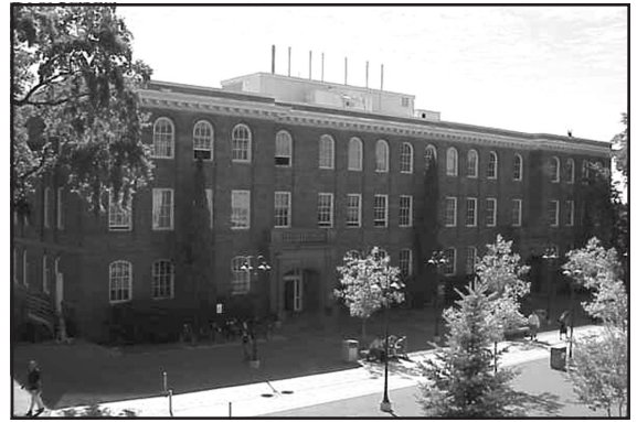
College Hall, home of the WSU Museum of Anthropology