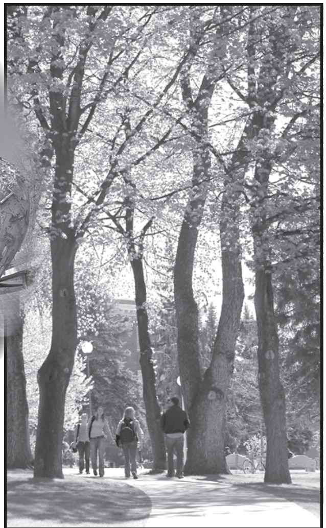
Pictured Above: Outdoor Art by Jim Dine at WSU and Strolling Through Campus