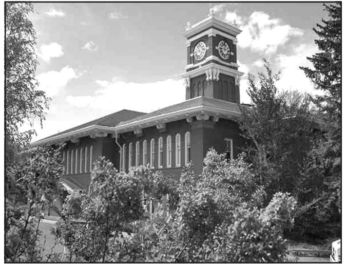
WSU's Bryan Hall

This session will examine the legal and ethical parameters of deaccessioning with an aim to offering guidelines for developing and pursuing prudent deaccessioning policy in the current financial climate. Will include discussion of current case studies; e.g., Brandeis.