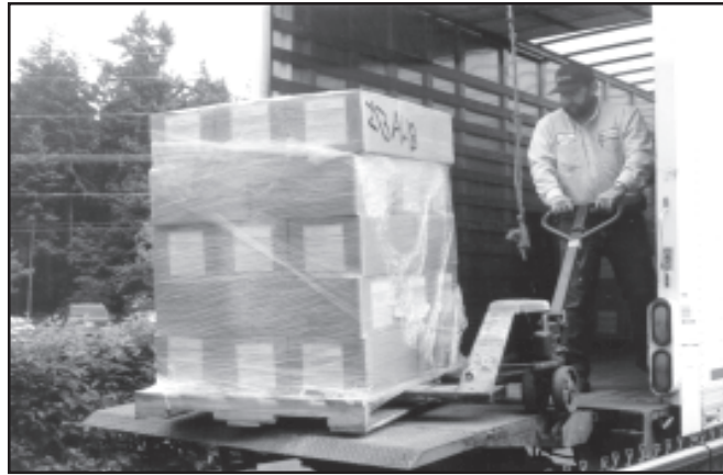
50,000 Museums of Washington maps arrive at the conference in Lacey.