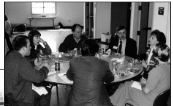
^ This round table discussion on "Restoration vs. Conservation" was one of many that took place during lunch at the conference.